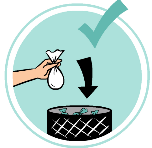
Responsible pet owners pick up after their pets and properly dispose of it in the trash. GOOD JOB!