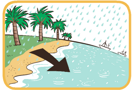
Pet waste breaks down and enters local waterways and Tampa Bay.