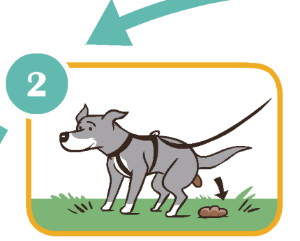
When not picked up and disposed of properly, pet waste stinks and is a hazard to step in, but that's only the beginning.

Every day in the Tampa Bay area, about 125 tons of pet waste is deposited on the ground that can add up to a pile of problems. Unscooped pet waste not only increases health risks to humans and other pets, it greatly impacts local water bodies with excess nutrients, leading to potential algae blooms and fish kills.