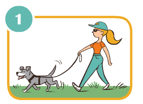
The cycle begins out walking your dog. When they do their business...